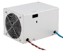
PCA-20 / PCA-25

2 kW / 2.5 kW up to 2 kV 110-240 V / 200-240 V AC